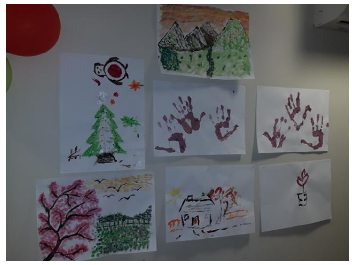
Some examples of our talented resident's art work

The residents enjoyed making a gingerbread house and the ginger bread men to live